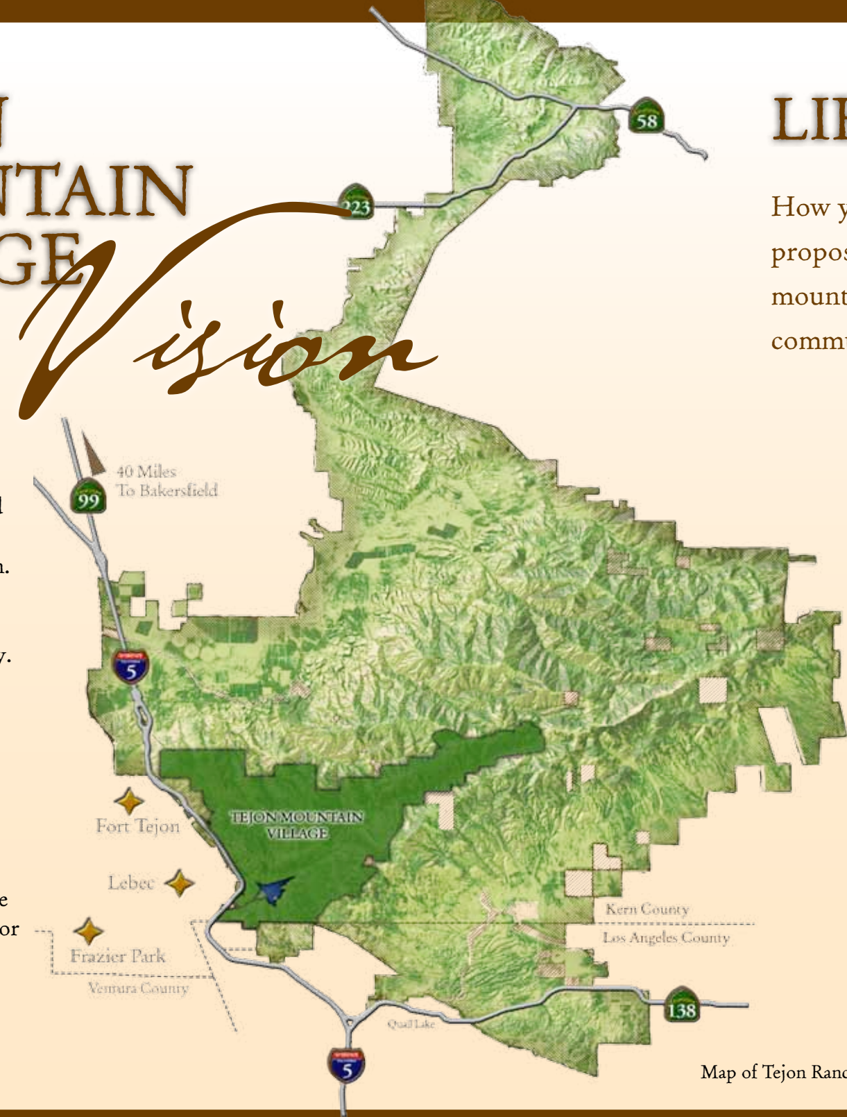
Map of Tejon Ranch

New jobs, regional economic gains and expanded public services will all help Tejon Mountain Village become a true community asset for Kern County.